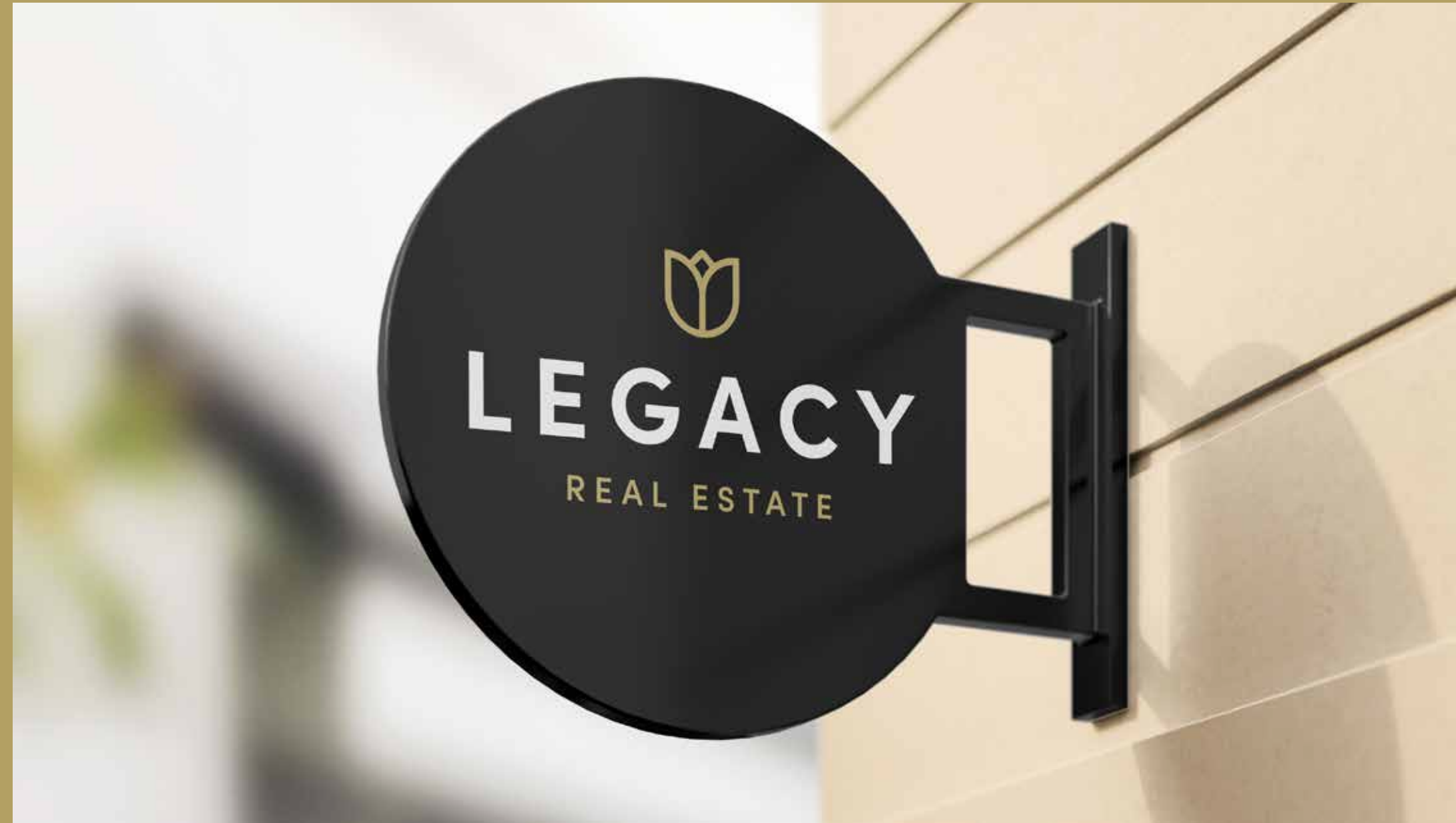
Real estate agency signage.