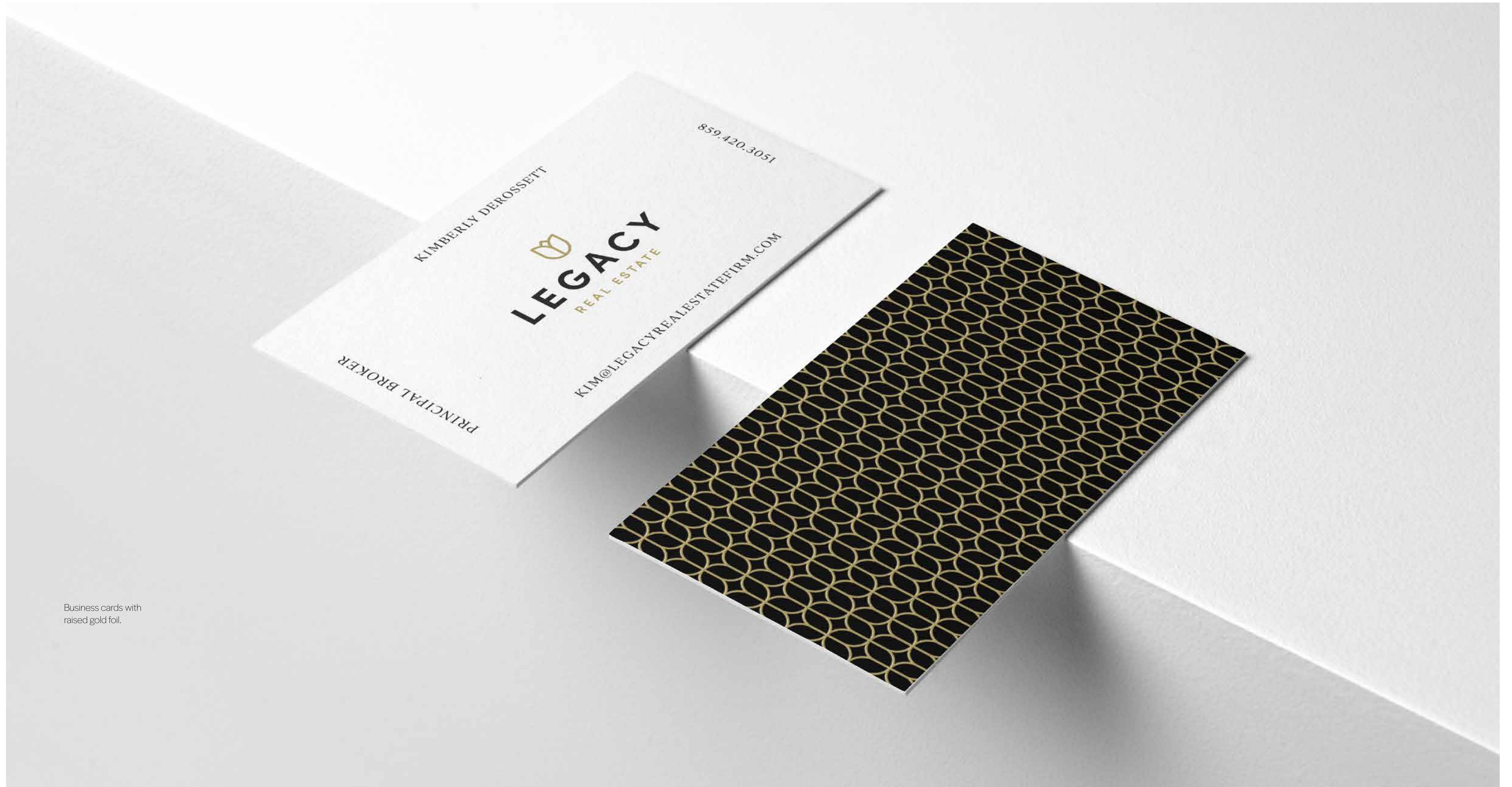
Business cards with raised gold foil.