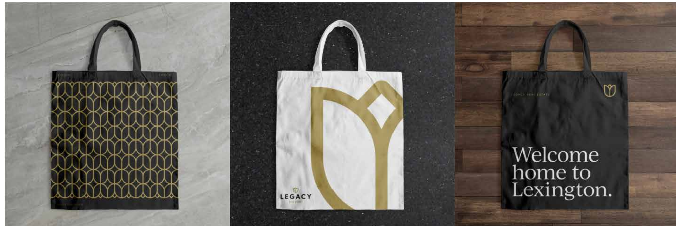
LEFT Canvas totes for new clients