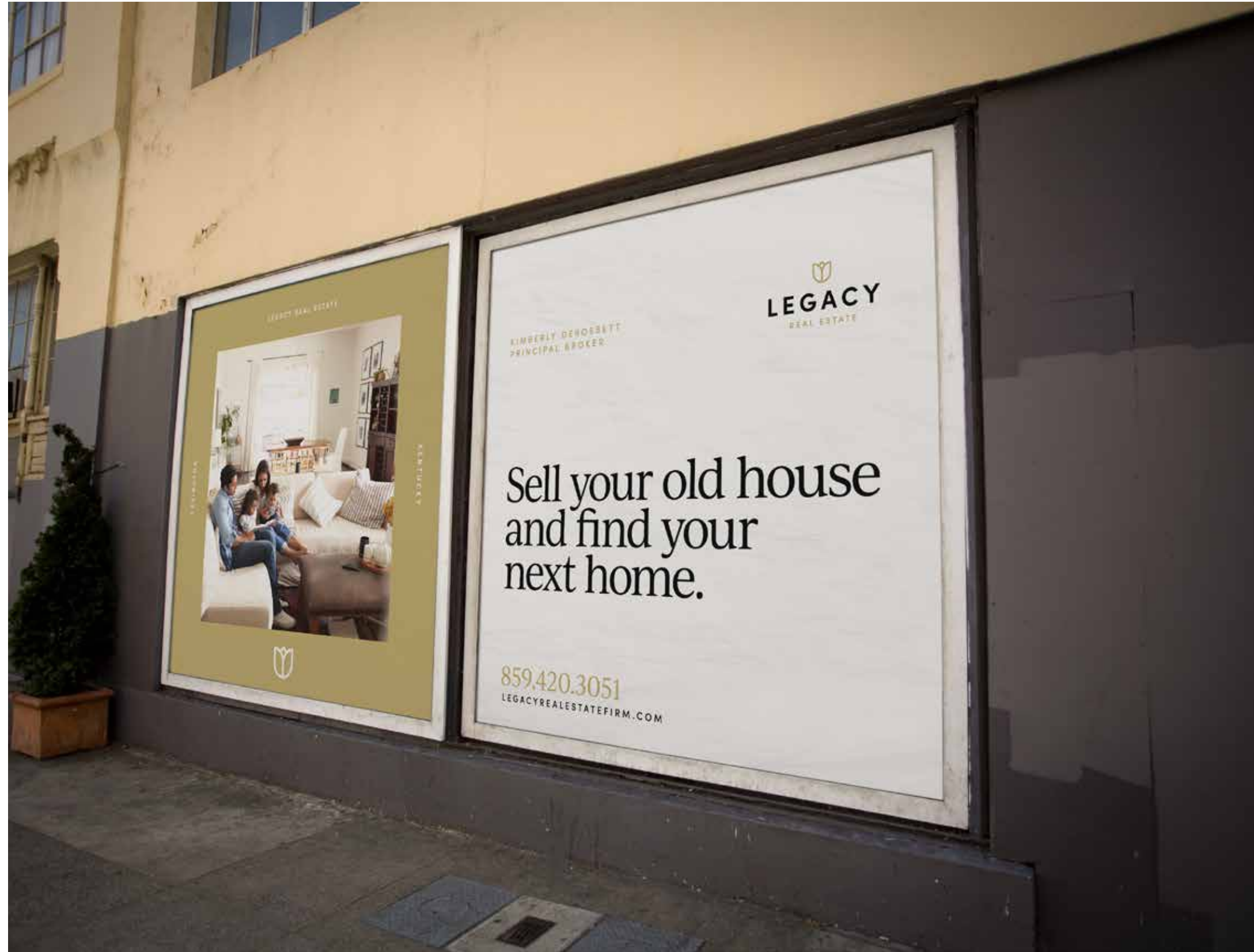
All advertising imagery features families inside warm interiors.